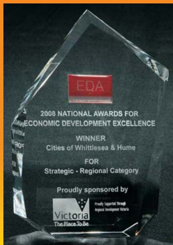
Economic Development Australia, 2008 Award Winner 2009 Finalist

The Plenty Food Group (PFG) is a food manufacturing industry network for companies based in Melbourne's north, entirely focused on assisting small, medium and large companies in food processing, or those supplying products and services to the food manufacturing industry.